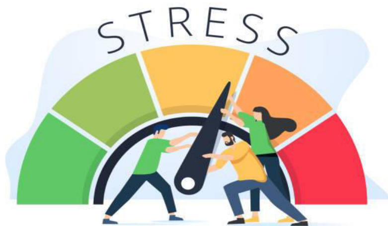
Рис. 2. Стресс