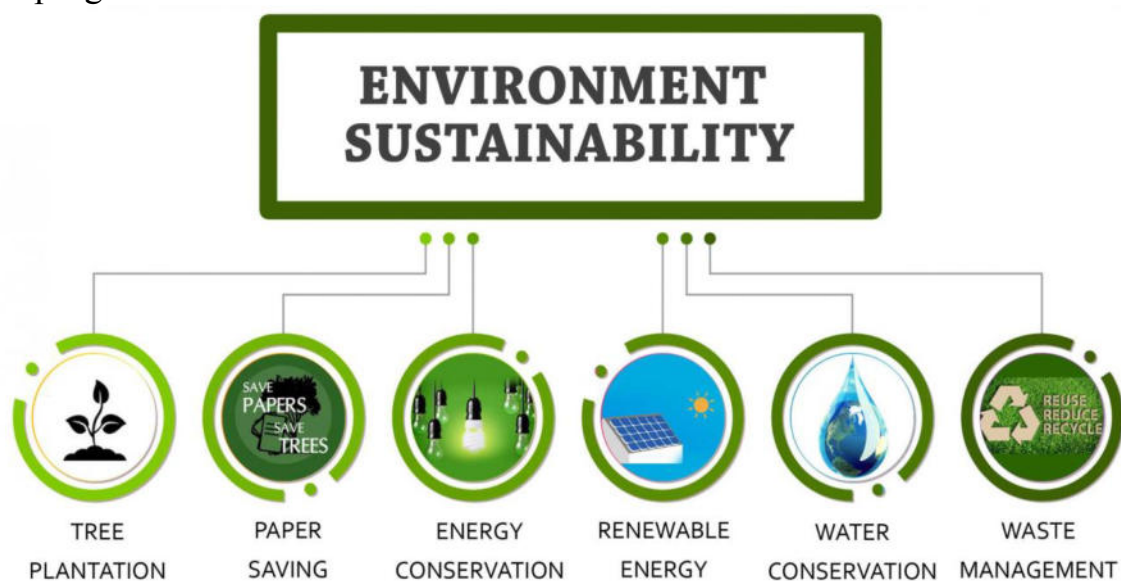
Рис. 6. Схема направлений защиты окружающей среды

It is the joint efforts of many scientists and special public organizations that can deal with the problem and take necessary measures to protect the environment. It is still a big job and much remains to be done. However scientists are confident that planned actions of all countries can eliminate pollution and achieve successes in purifying air, water and soil and in safeguarding natural resources. At the same time one must realize that social and political circumstances may stand in the way of further progress in this field.