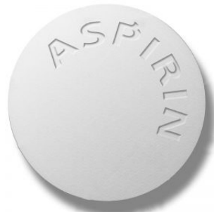
Рис. 5. Таблетка аспирина

4. Aspirin is very irritating to the stomach and many aspirin takers complain about upset stomachs. There is a right way and wrong way to take aspirin. The best way is to chew the tablets before swallowing them with water, but few people can stand the bitter taste. Some people suggest crushing the tablets in milk or orange juice and drinking that.