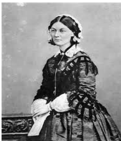
Рис. 1. Портрет Ф. Найтингейл

She had much to do with bringing the Red Cross into army medical activities. Florence Nightingale lived to be very old and on August 13, 1910 at the age of ninety she died.