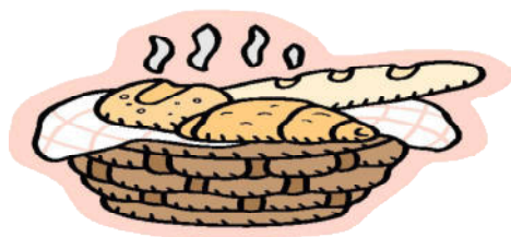
Рис. 3. Углеводы

Carbohydrates give you more than 70% of your _____.